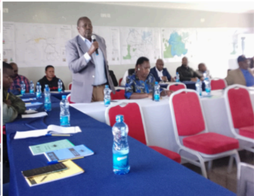
Figure SEQ Figure \* ARABIC 4: Contribution from members of the public