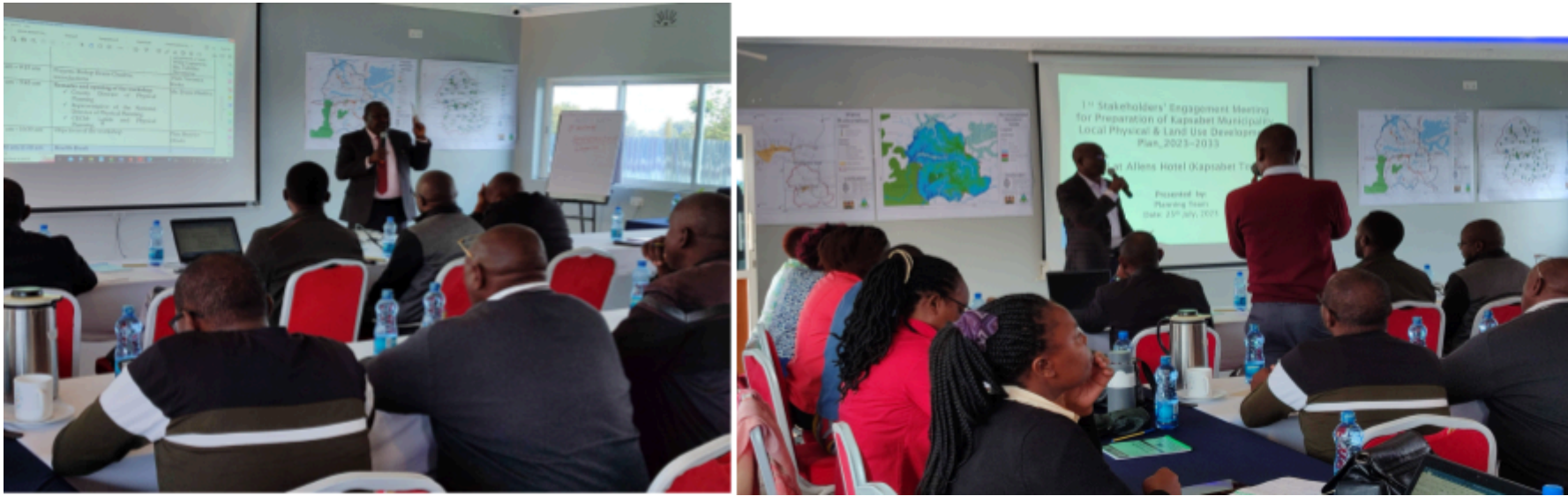
Figure SEQ Figure \* ARABIC 2: Members of the planning team addressing the stakeholders